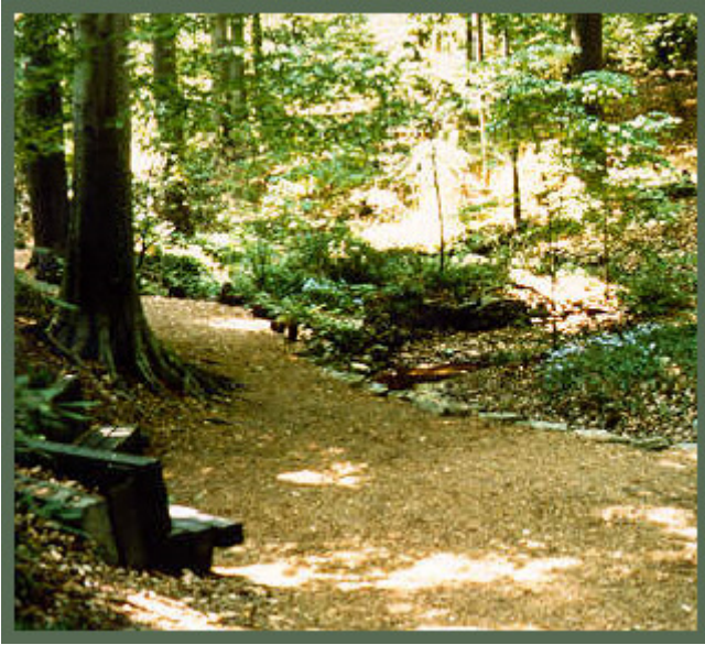
Fern Valley - 2011