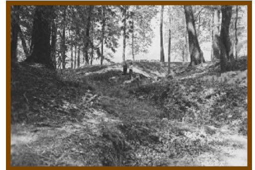
Fern Valley - 1950's

Fern Valley is a 'Cinderella' Story. Up until the late 1950's the area had been a refuse heap in the Arboretum. It was untended and covered with honeysuckle vines, poison ivy and other invasive plants. This small site was to become recycled land when the garden clubs agreed to restore this area with ferns at first, then trees and other native plants.