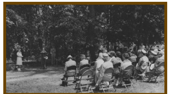
Dedication of Fern Valley - 1960

In 1968 a committee was organized to acquire about 3,000 plants from garden club members to add color to the garden during the summer months. Fern Valley was opened to the public in 1969